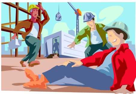
Company A No Safety Program = Frequent Injuries